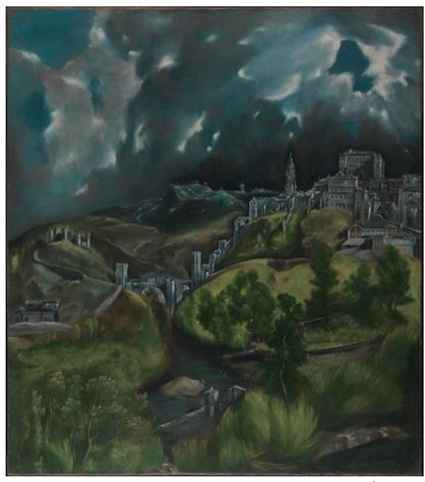
Both the landscape and the sky seem to be moving - is a fierce storm about to break?

rolling landscape around the city. The inhabited part of Toledo takes up only a small portion of the painting.