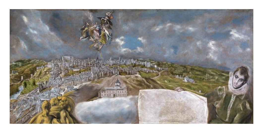
December 5, 1888, Toledo (continued)

The second of El Greco's paintings with Toledo as the main subject, is View and Plan of Toledo, completed between 1610-1614. Over 7½-ft wide and over 4-ft high, El Greco provides two different views of the city, although, again, he relocates some of the buildings to show them in greater detail. The structure shown floating on a cloud represents the Tavera Hospital. The hospital's administrator may have commissioned the painting. Toledo had served as the Capital of the kingdom of Castile from 1085 and was the main court for the Spanish kings until 1561 when King Philip II moved his court and administrative capital to the new town of Madrid. View and Plan of Toledo may have been an attempt to convince the King to relocate the capital back to Toledo, but the King remained in his new palace at El Escorial.