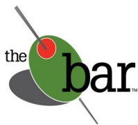
The Olive Bar Farmington